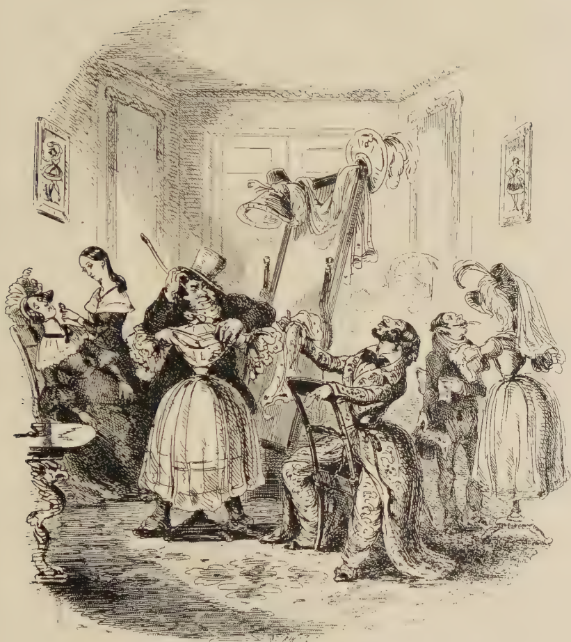
THE PROFESSIONAL GENTLEMAN AT MADAME MANTALINI'S.